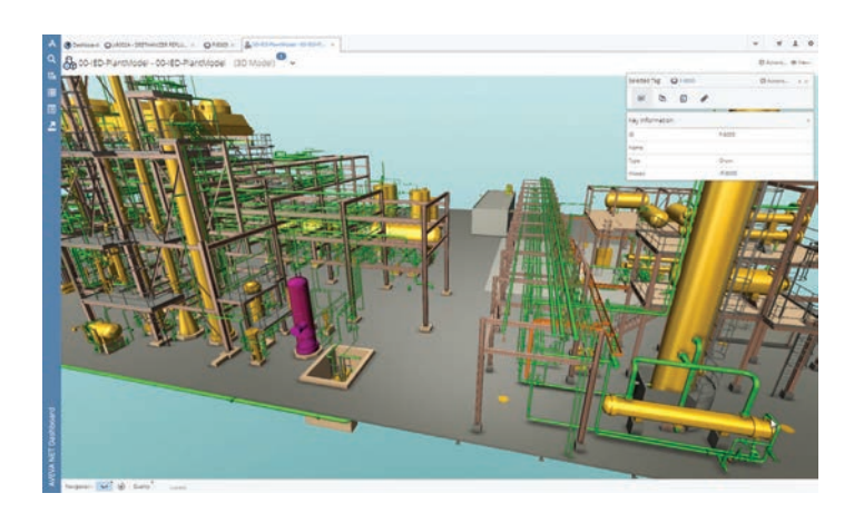
3D model visualization